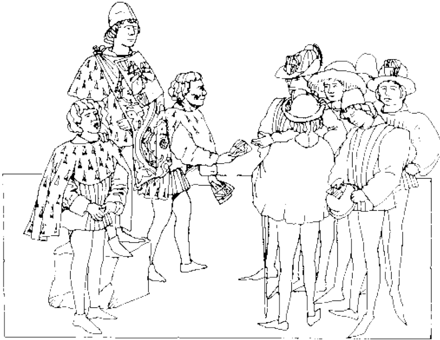
Figure 1: Heralds in Matching Tabards, from Rene' of Anjou's Tournament Book

Several other examples can be seen of heralds in the service of the same monarch wearing matching tabards. Figure 2 shows a procession of the English Officers of Arms. Their tabards all bear the same emblazon.