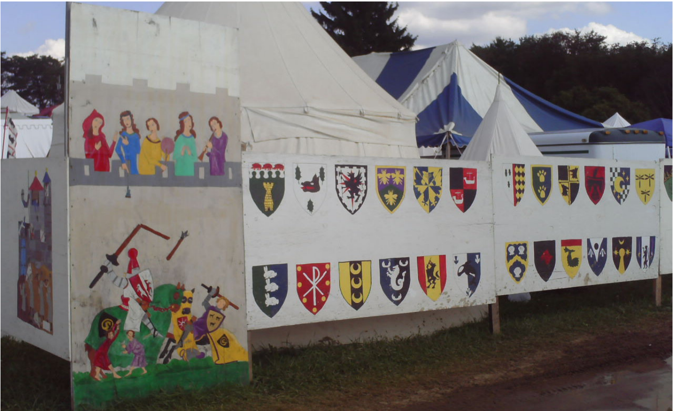
This Pennsic encampment displays not only the arms of its residents, but a nifty battle scene, too!