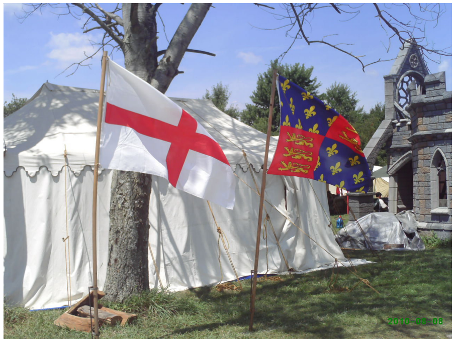
Left: The Barony of Carillion (East Kingdom) gets its name from its most famous mundane employer, Bell Laboratories. Right: Shadowclans displays traditional English heraldry.