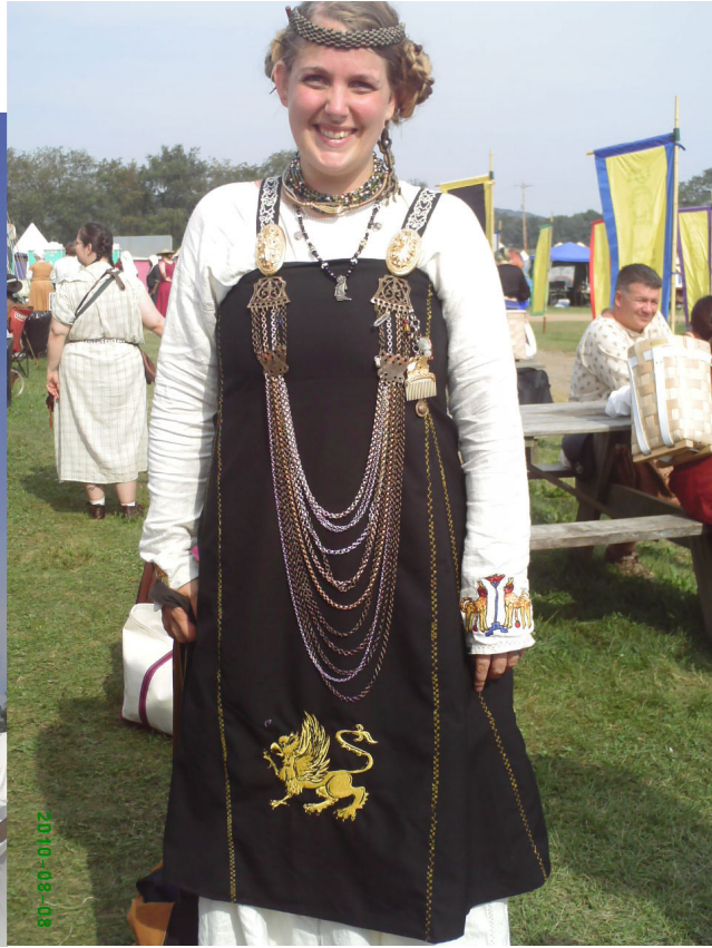
Left: Ealdomere's banners fly over that Kingdom's encampment. Right: A woman with Baltic embellishments to her apron dress ... plus the golden lion of Northshield.