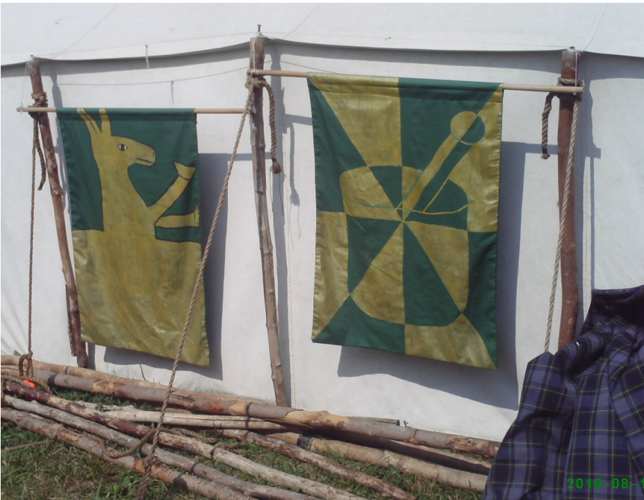
A husband-and-wife display of personal devices on a tent.